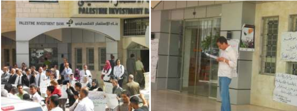
Year 2011 protest movement and strike at the Investment Bank