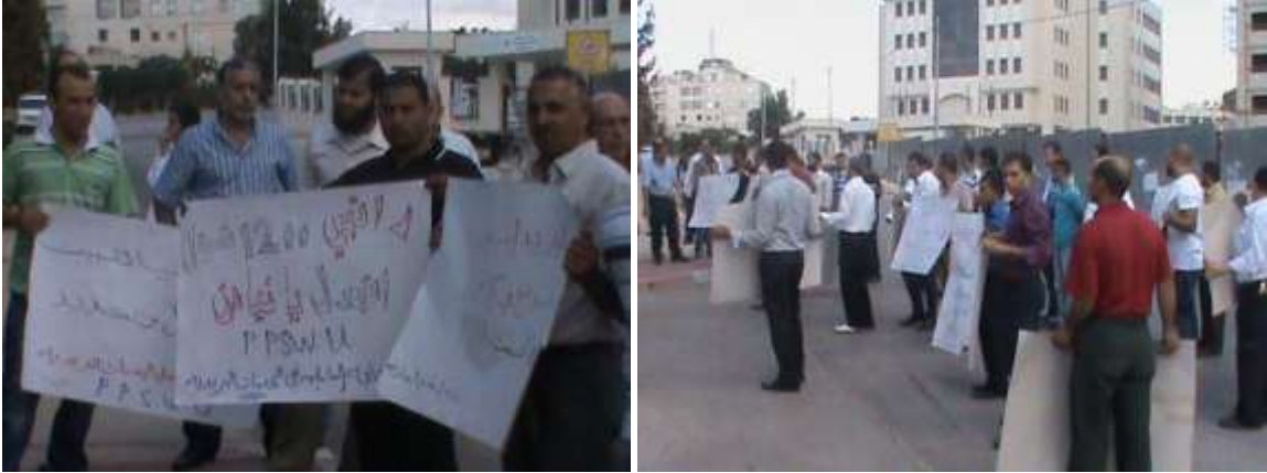
Postal workers sit-in in front of the Council of Ministers in 2012 organized by the Postal Service Workers' Union, an affiliate of the General Union of Independent Trade Unions in Palestine; one of the signs reads: "My salary is 1200 NIS, would you switch with me Fayyad?"