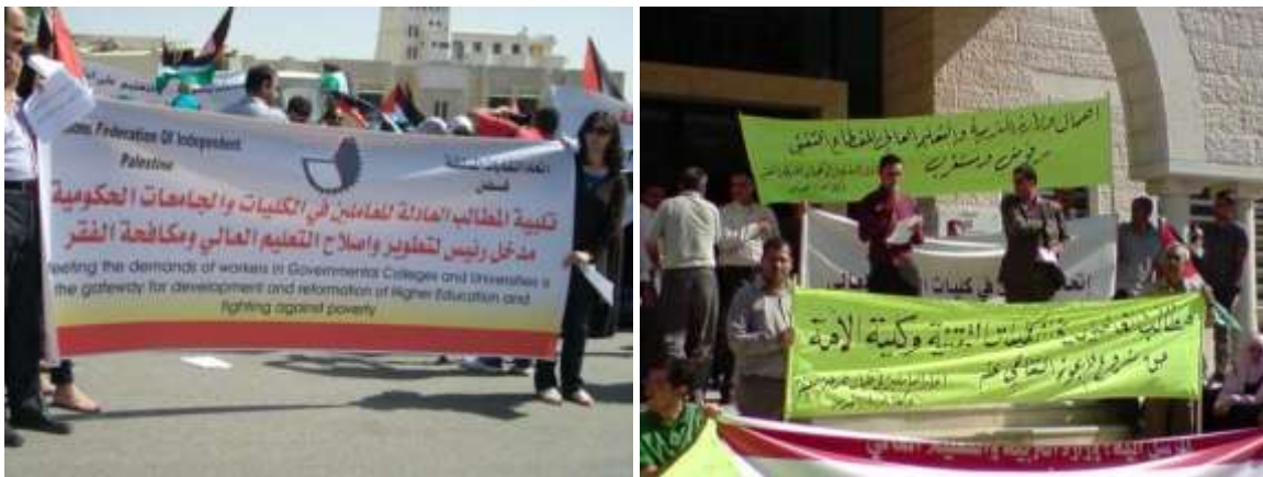
Governmental Colleges and Universities Employees Federation protests in 2010 & 2009