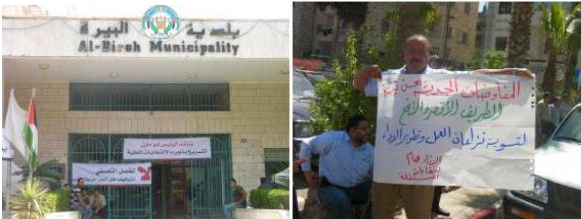
Strikes in Al-Bireh and Ramallah municipalities in 2011

Local authorities is one of the sectors where collective bargaining takes place on a regular basis, and where several agreements have been signed in past years at workplace level. In many municipalities and local councils, employees have formed unions and workers' committees, which generally undertake regular elections although the process might be politicized, in particular in bigger municipalities. In principle, employees of municipalities and local authorities do neither fall under the scope of the Palestinian labor law, nor under the scope of the civil service law. In the past, various categories of employees in the same municipality used to be subjected to different employment regimes and statutes, leading to blatant discriminations. On 30/3/2009, the Council of Ministers adopted a regulation for local authorities' employees, which specifies their individual rights and duties. It was scheduled to be gradually applied to all municipalities and local councils through successive stages over a two year period, and to replace all former legislation thus unifying the legal framework. This adjustment period led to labor conflicts in several municipalities over the implementation of the new legislation, and employees' unions have also engaged in bargaining for additional rights. In 2011, 7 labor disputes were registered by the Ministry of Labor in this sector. Several municipalities have collective work agreements, including Qalqilia, Anabta, Al-Bireh and Betunia.