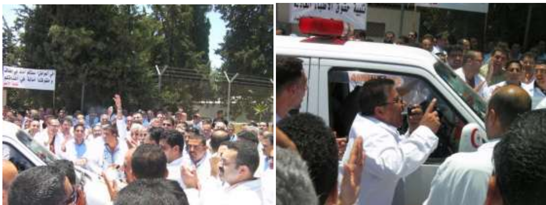
Physician's sit-in in 2011

Although its article one stipulates that governmental workers have the right to strike, article 2 subjects strikes to the conditions set in article 67 of the Palestinian labor law and article 3 gives the right to the government or any other party to appeal to the High Court of Justice to order the end of a strike that violates this law or causes “severe damage to public interest”. This law has been used on several instances in attempts to stop strikes in the public sector, including against physicians on strike in 2011.