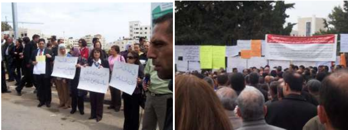
Public sector employees sit-in in April 2008 to protest the law on public sector strikes

The government has tried to restrict the right to strike of public sector employees through the issuance of a law by presidential decision no 5 of the year 2008 that entered in force on April 5 th , 2008. A massive protest organized at the time in front of the Council of Ministers by public sector unions, and supported by the Federation of Independent Unions and the UNRWA Area Staff Union, did not manage to stop the law from being issued and implemented.