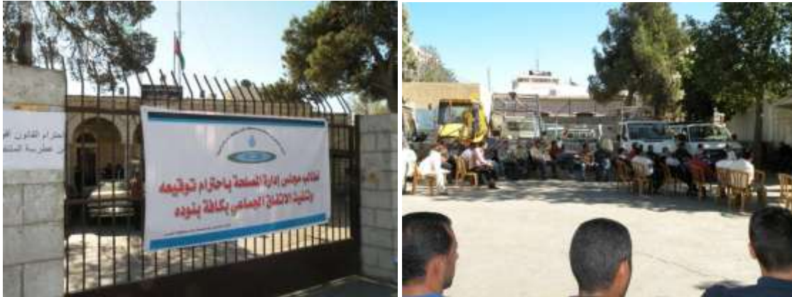
30/11/2010, strike at the Water Undertaking for the implementation of the collective agreement