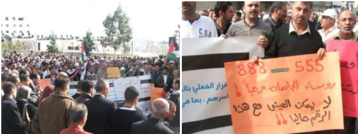
University professors demonstration in Ramallah on 18/11/2008

The banner of one of the protestors reads "555-888, hello presidents of universities! We cannot live on this amount!"